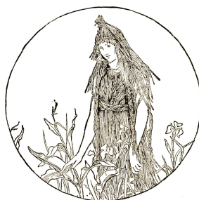
Cap O' Rushes – Old English Folk Tale